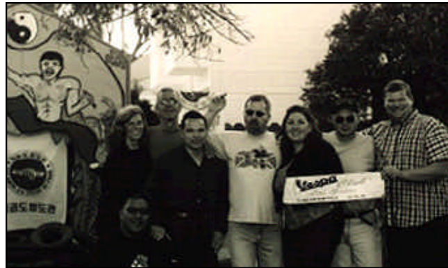
VCLG at "September Shindig"