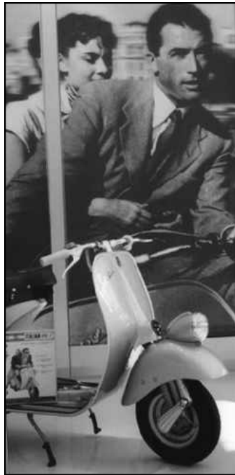
Rolf's scooter at the LA Vespa Boutique